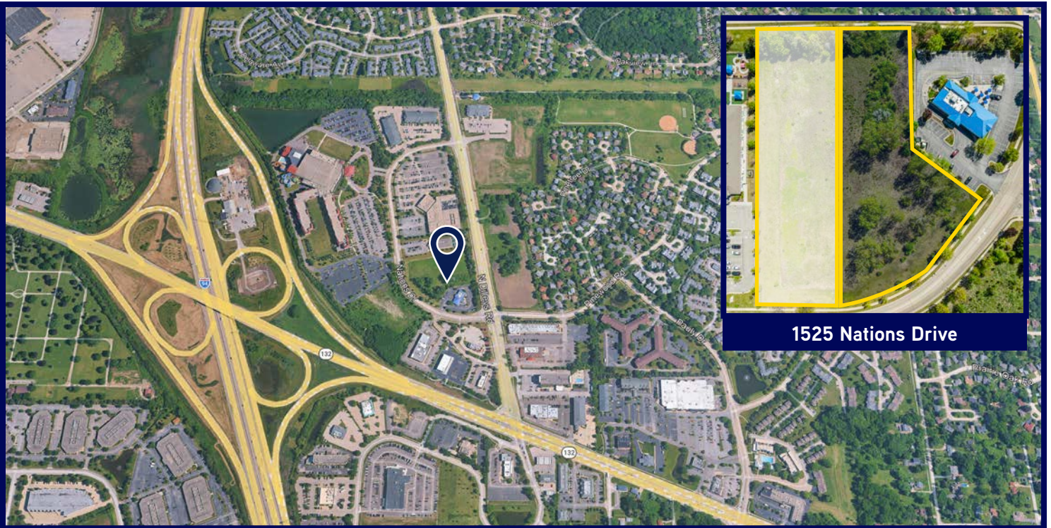
1525 Nations Drive